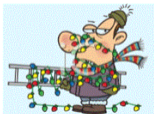
Help is Greatly Appreciated!!!

We will be taking down the Christmas decorations in church after Mass on Sunday, January 2nd. Please come if you are able to help. Thank-you!