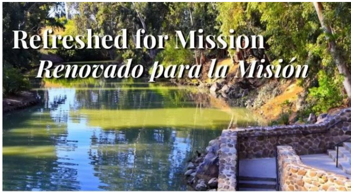
The baptismal waters of Jesus: The River Jordan.